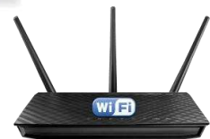
Figure 3.2 4

Wi-Fi router is used to for internetwork operations inside of a hospital and simply data transmission from pc's to sever.