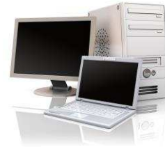
Figure 3.2 1

Purpose of this pc is to give information when Patients ask information about doctors, medicine available lab tests etc. To perform such Action it need very efficient computer otherwise due to that reason patients have to wait for a long time to get what they ask for.