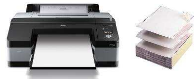
Figure 3.2 3

Simply this device is for printing bills and view reports.