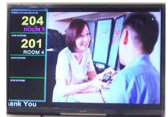
Figure 3.2 2

This unit is for display the channel number when the patients come to see their consultants. It will avoid chaos. And also display Hospital welcome screen, video, information etc.